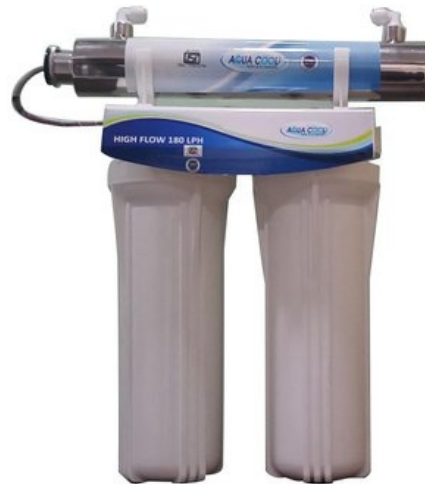
High Flow Ultraviolet Steriliser 150 LPH, 250 LPH, 500 LPH, 1500 LPH & More