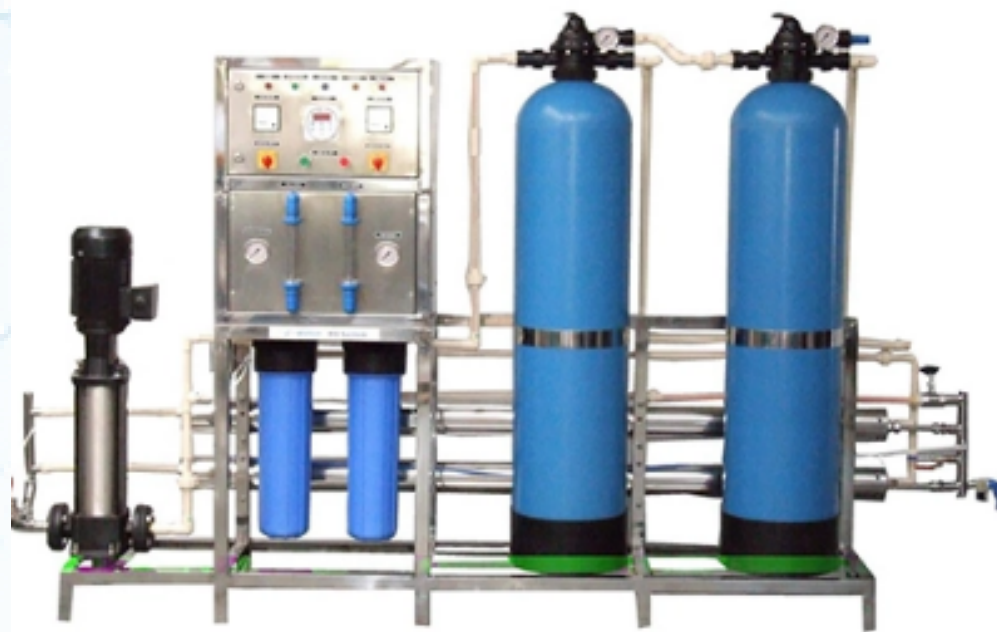
2000 Lph Industrial Reverse Osmosis Plant

Reverse Osmosis Plants removes high TDS, Salinity & Microbes from source water