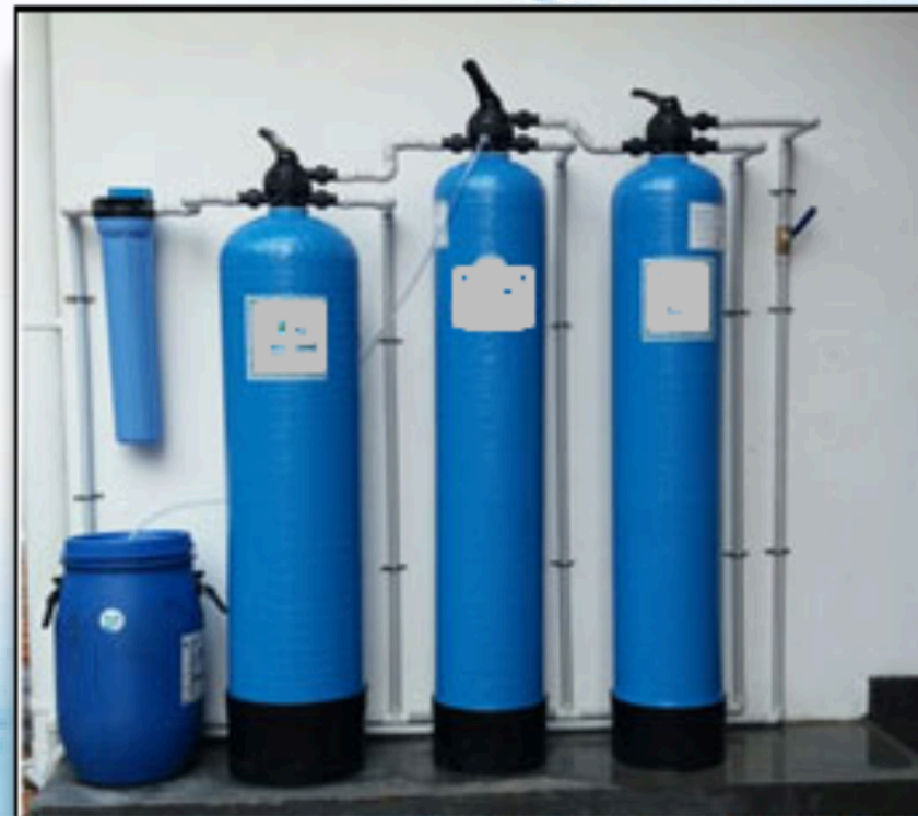
Premium Water Treatment Plant