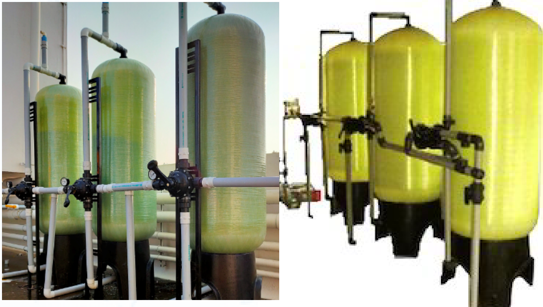
Commercial WTP Premium Model