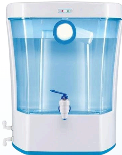
RO 15 lph with storage UV 15 lph with storage