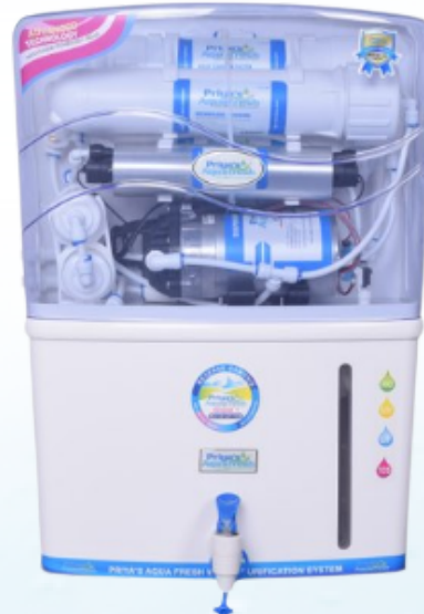
RO + UV Purifier 15 lph with Storage