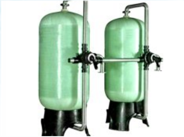
Commercial WTP Base Model