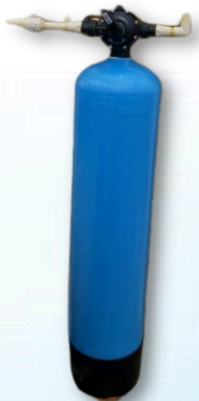
Single Stage Water Treatment Plant