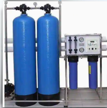
Dual Stage Water Treatment Plant