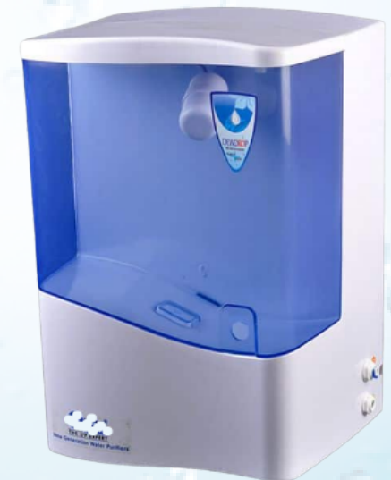
RO 15 lph with storage UV 15 lph with storage