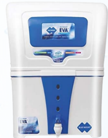
Alkaline RO Water Purifier